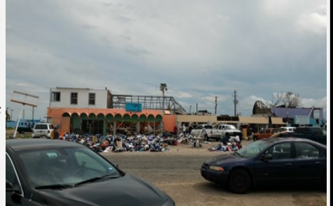
Pictured: Some of the devastation in Houston, Texas.