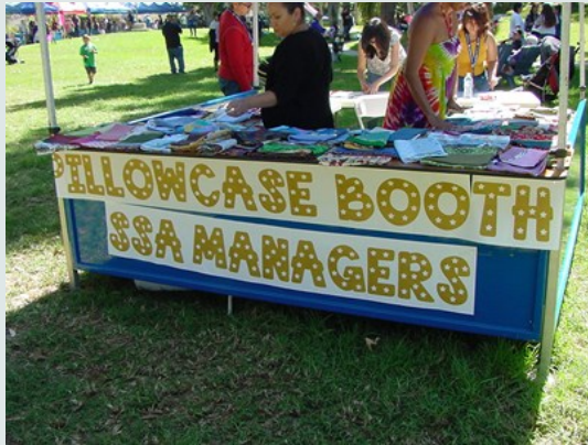
Pictured (left): A booth created by SSA Managers where children could make their own pillowcases.

The 33 rd Annual Foster Family Picnic was held on September 24 th in Garden Grove. The primary sponsor of the picnic was LA CASA, the support auxiliary for Orangewood Children and Family Center. The Foster Care Auxiliary of Orange County, who organized the picnic, is a nonprofit whose primary focus is to help Orange County families with foster and adopted children. Staff from Children and Family Services and Foster Care Eligibility volunteered at the picnic; it was a huge success with 235 children in attendance.