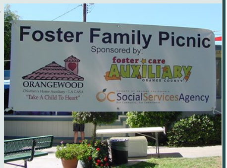
Pictured: A banner welcoming guests to the 33rd Annual Foster Family Picnic.