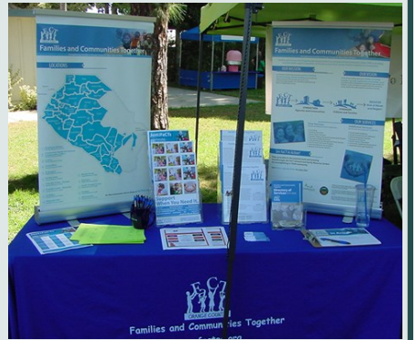
Pictured (right): Families and Communities Together (FaCT) booth.