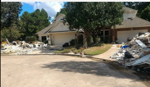
Pictured: Some of the devastation in Houston, Texas.

responsibility was to provide support to children in shelters by reading to them, playing with them, and comforting them while their parents were busy with filling out paperwork and trying to recoup the possessions they had lost.