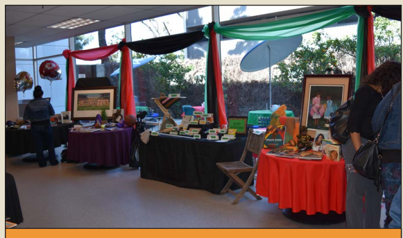
Pictured: Various table displays set up at the CFS Echoff Annex Lunchroom honoring the contributions of African Americans

The lunchroom was filled with table displays paying tribute to various contributions of African Americans throughout history. One table was dedicated to African American trailblazers such as scientist and inventor George Washington Carver, abolitionist and activist Harriet Tubman and, the first child to desegregate an all-white school in Louisiana, Ruby Bridges. Other tables honored prominent black women and inventors in history. Did you know that potato chips, hair brushes, foldable chairs, the ice cream scoop and peanut butter were all invented by African Americans? Also highlighted