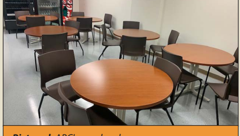
Pictured: ARC's new lunchroom