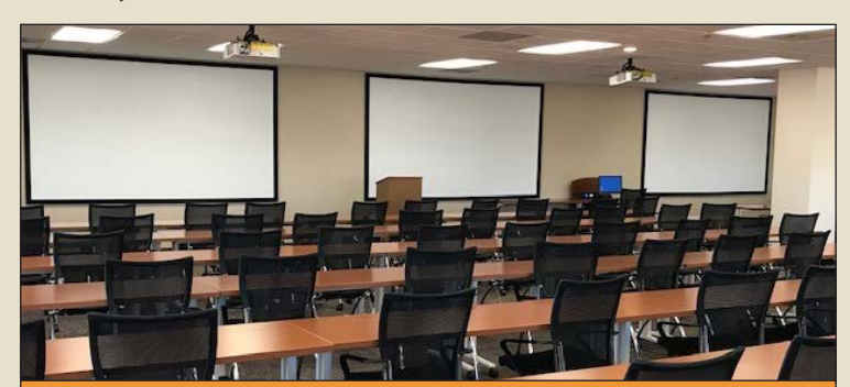
Pictured: GGRC's expanded conference room, which can also be converted for training room use